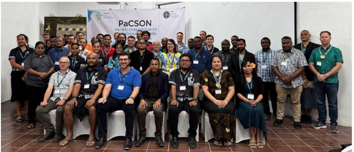
A group photo of the Opening Ceremony attendees

Please see Appendix A for the full agenda.