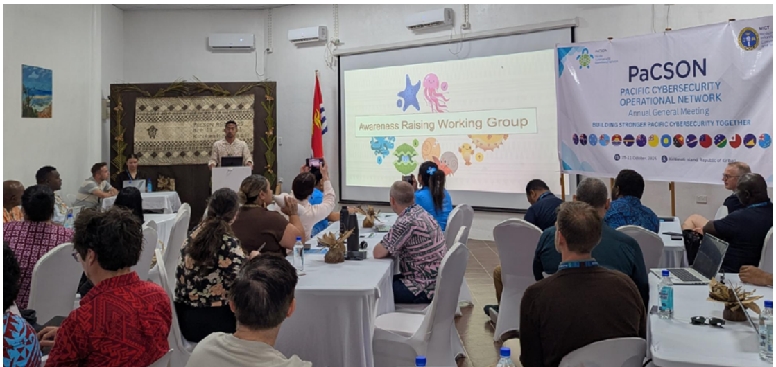
Awareness Raising Presentation